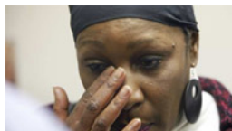
Sterilized by North Carolina, she felt raped once more