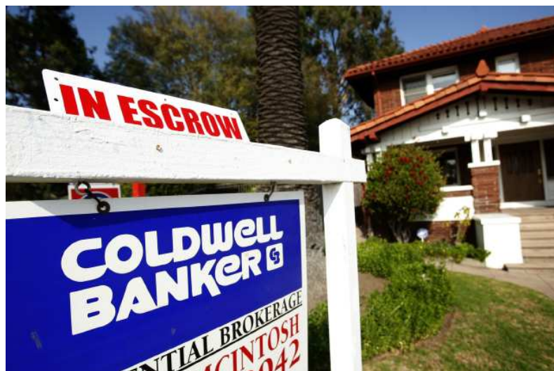
Home sales and prices slumped in December.

Comments 11 Share 49 4 Tweet 45 Recommend 33