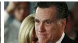
Romney's tax returns sit uneasily with Florida voters