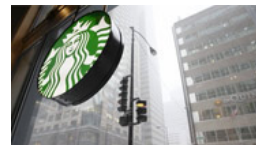
Starbucks to offer beer, wine at select locations