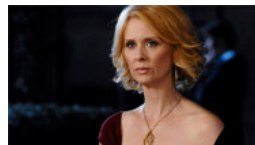
Cynthia Nixon says she's gay by 'choice'